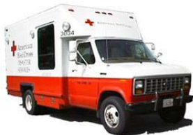
An American Red Cross Emergency Response Vehicle

The Red Cross strongly encourages any individual or business that is considering starting a collection or shipping goods to a disaster site to first locate a reliable relief organization that is willing and able to receive the donation, and can guarantee transportation and distribution.